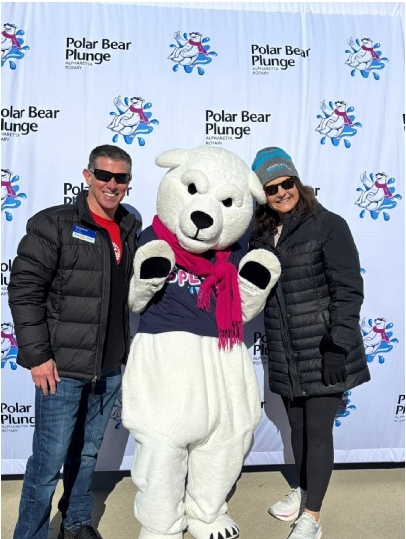
Posted by Gail LaFleche February 25, 2026