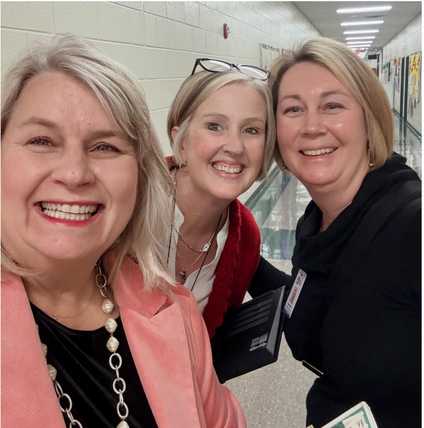
Posted by Katheryne Fields February 28, 2026