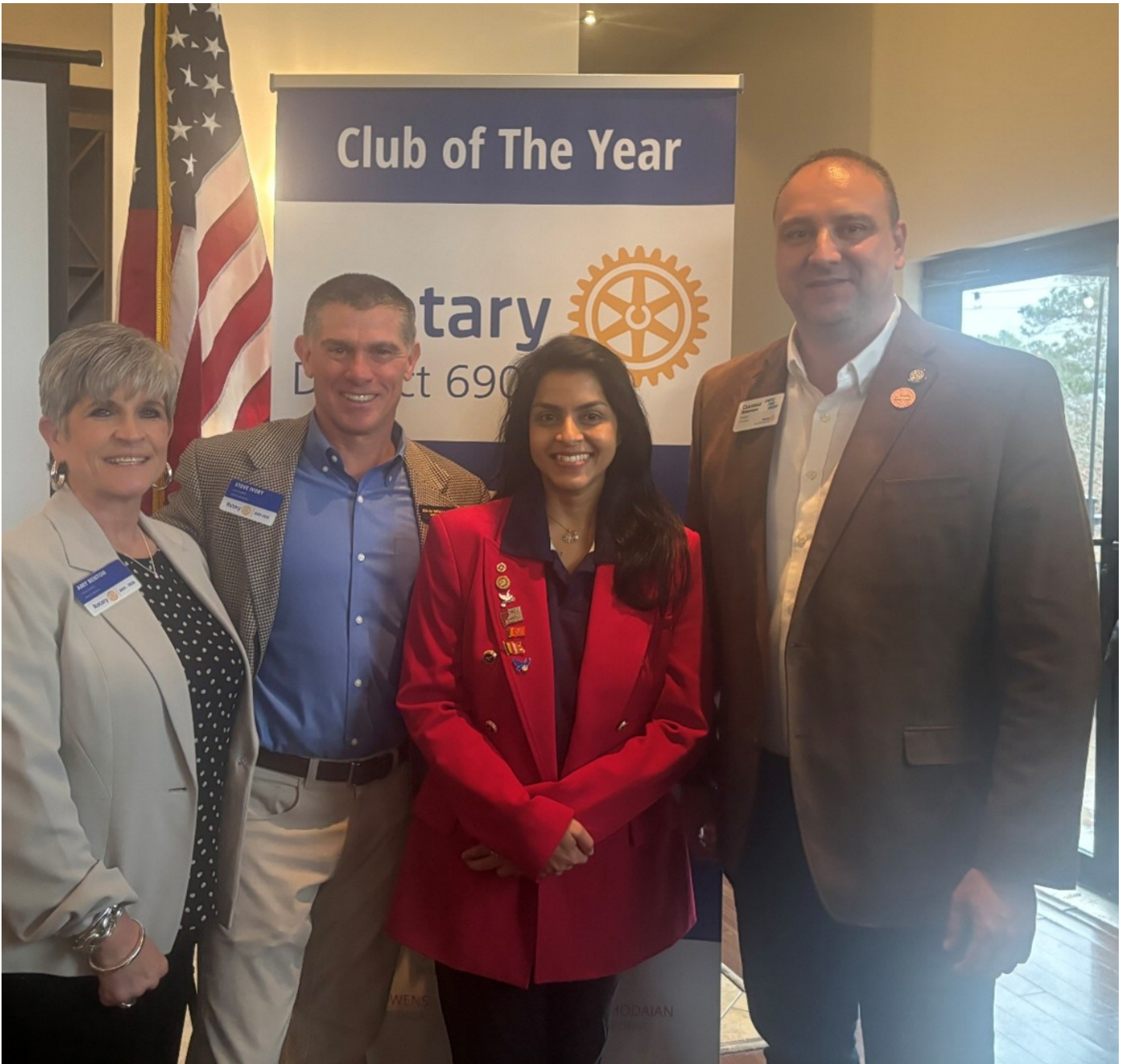
DG Steve with our visiting Peace Scholar at Peachtree City Rotary