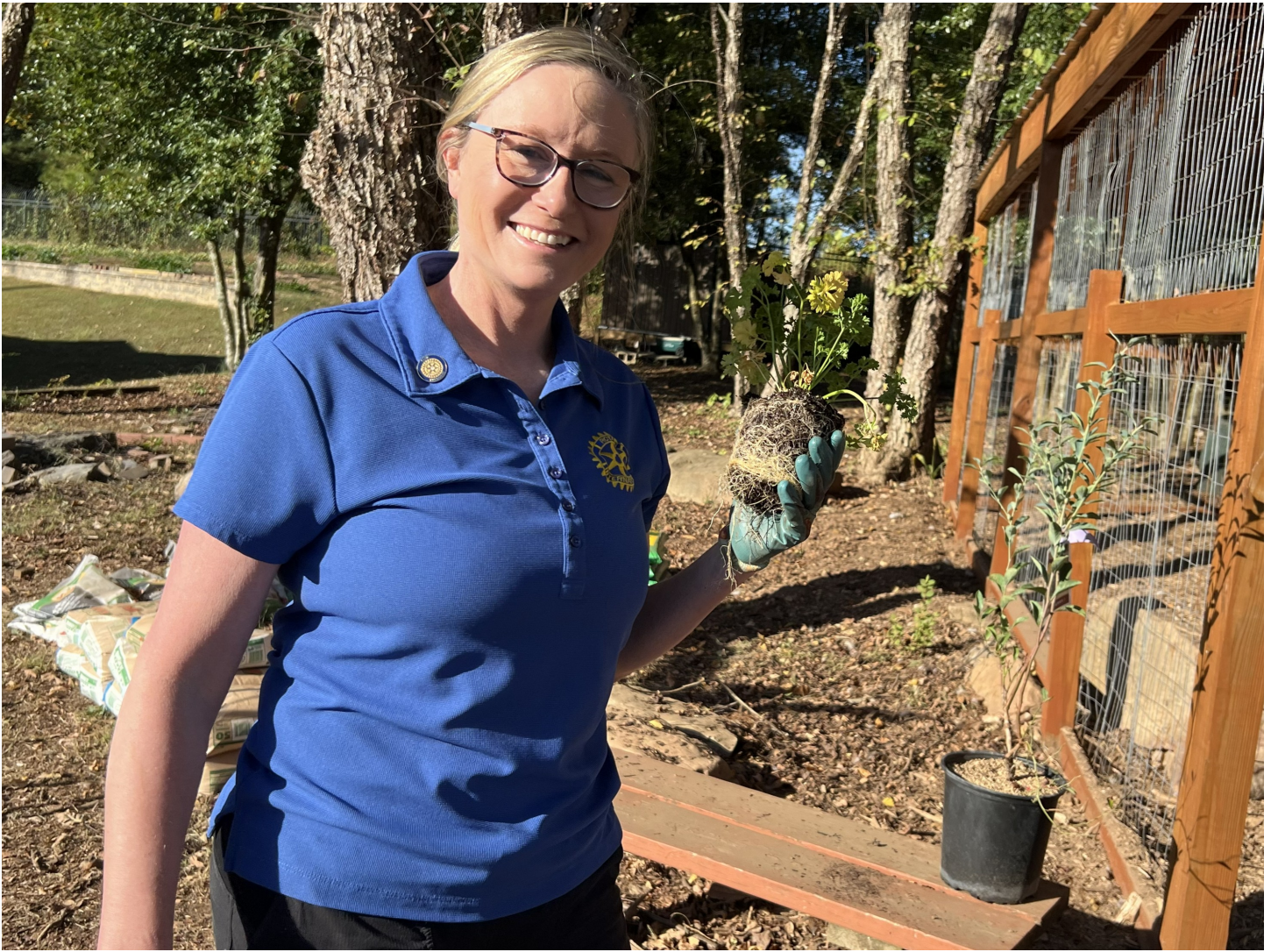
Posted by Whitney Higdon November 9, 2025