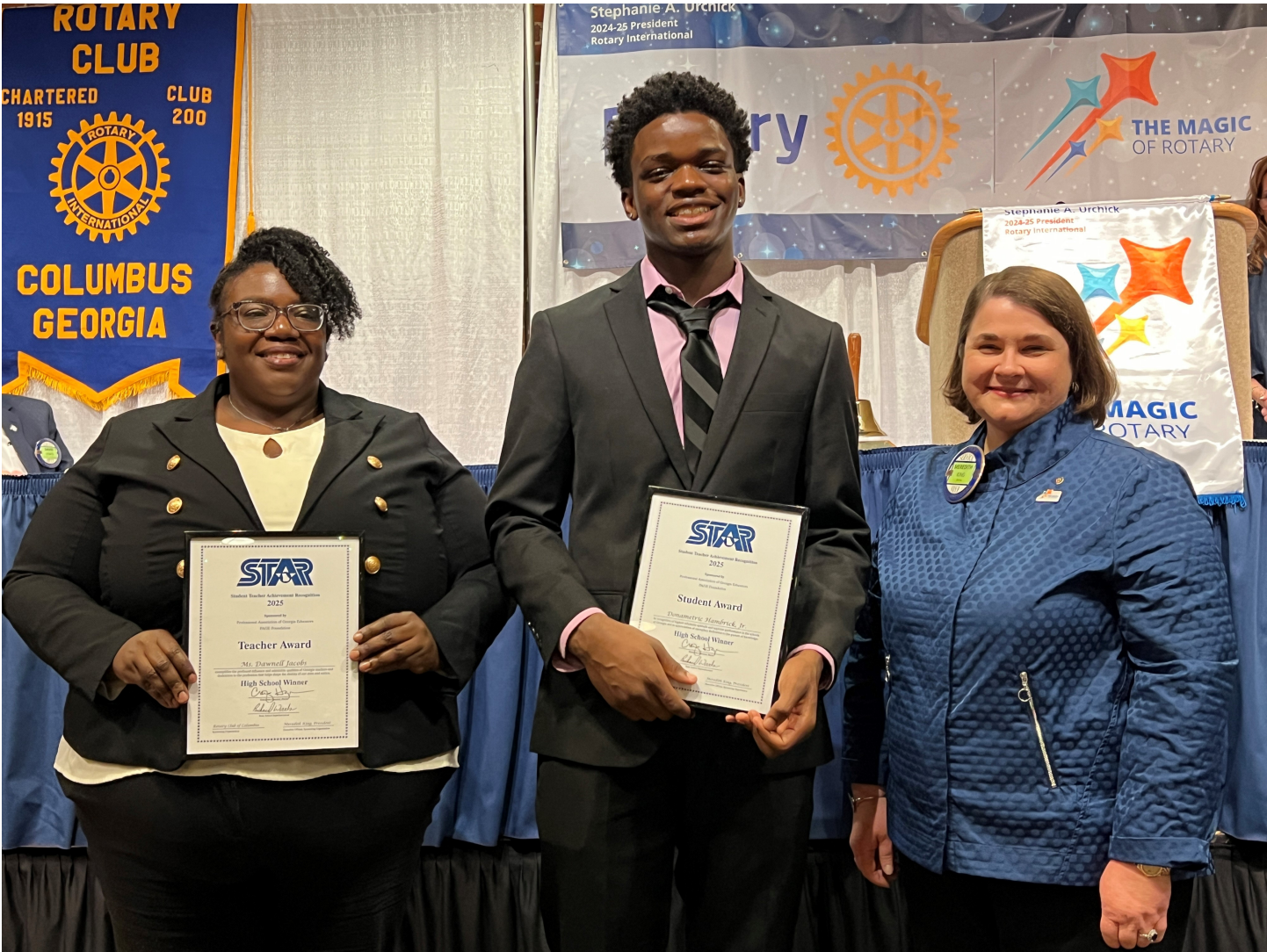
Posted by LeighAnn DiCesaris March 2, 2025