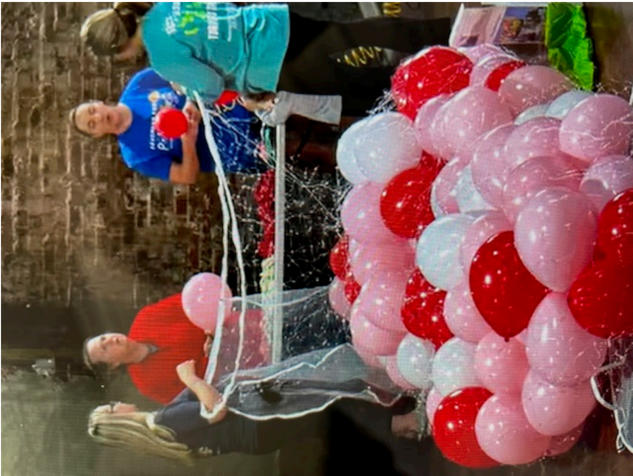
The Rotary Club of Cairo worked for months to organize and promote their Father-Daughter dance which draws a huge crowd from this Georgia town. Thanks to all their members who were there early this morning and late into the evening to make this special event happen.