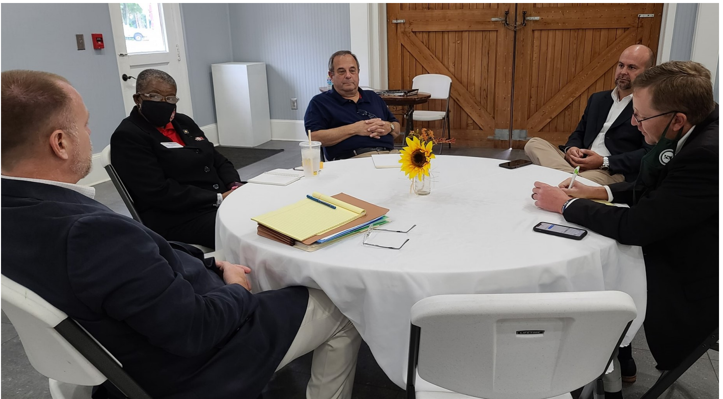
Posted by Kirk Driskell November 10, 2020