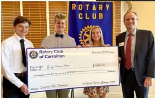
Above: Carrollton Rotary extends Many, many thanks to the Central High School Interact Club for its donation to our End Polio Now campaign!