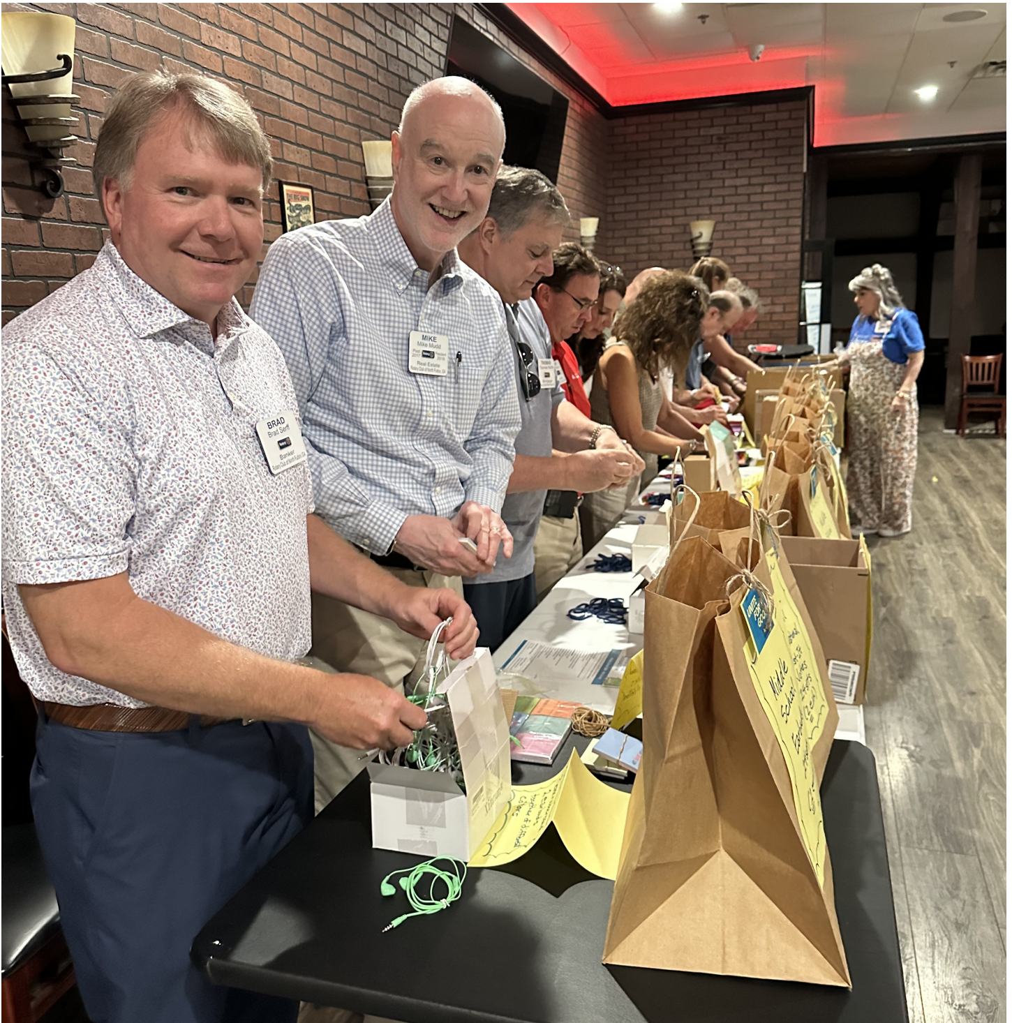
Posted by Lisa Gelber July 27, 2025