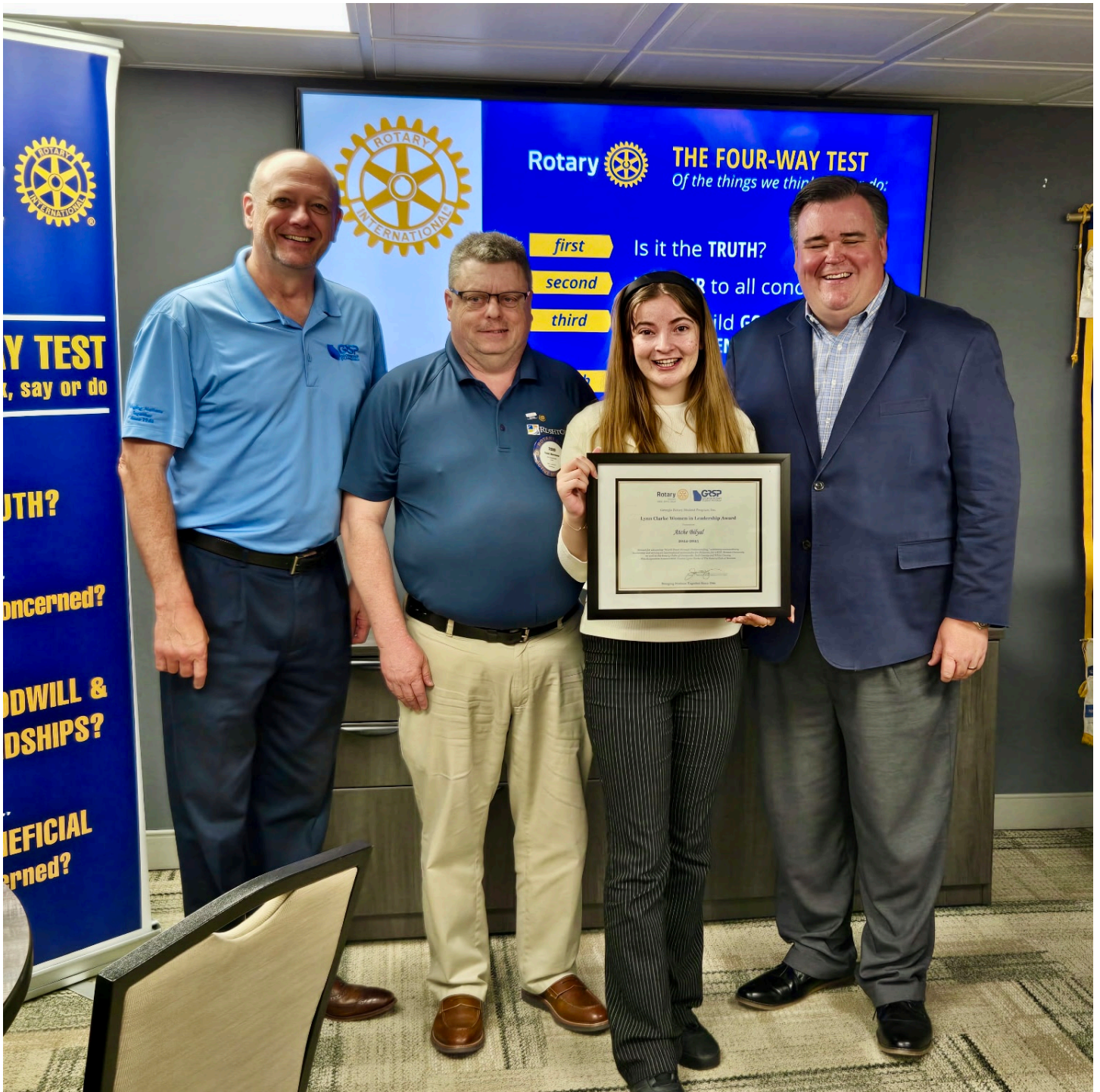
Posted by Kathy Fields May 3, 2025