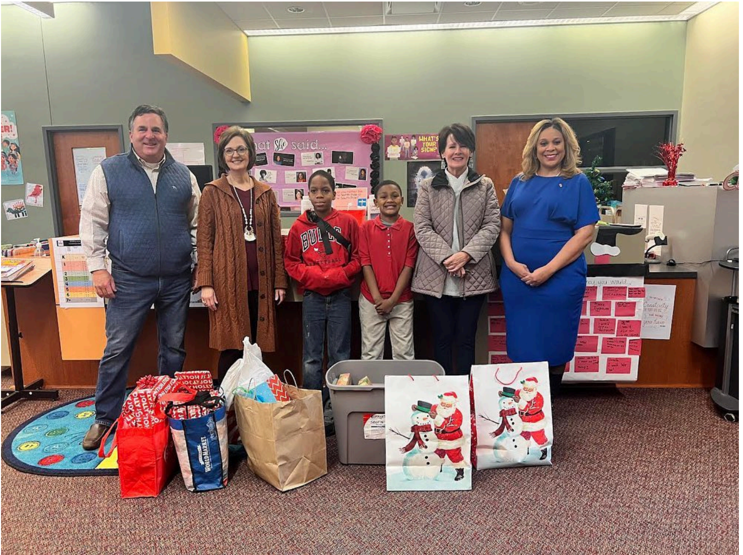
The Rotary Club of North Columbus was glad to be a part of Adopt a Family at Rigdon Road School! As Rotarians, we love any opportunity to get involved & give back to our community. Vinings Cumberland Rotarians dropped off 50 gifts for the young children at La Amistad for the after-school participants; many are ESL kids and some of club members volunteer to tutor them. The Rotary Club of Quitman spent a chilly but worthwhile morning picking up litter on the club's adopted two-mile stretch of SH37 north of Quitman. Eighteen big bags were collected. "Don't Mess with Texas!"