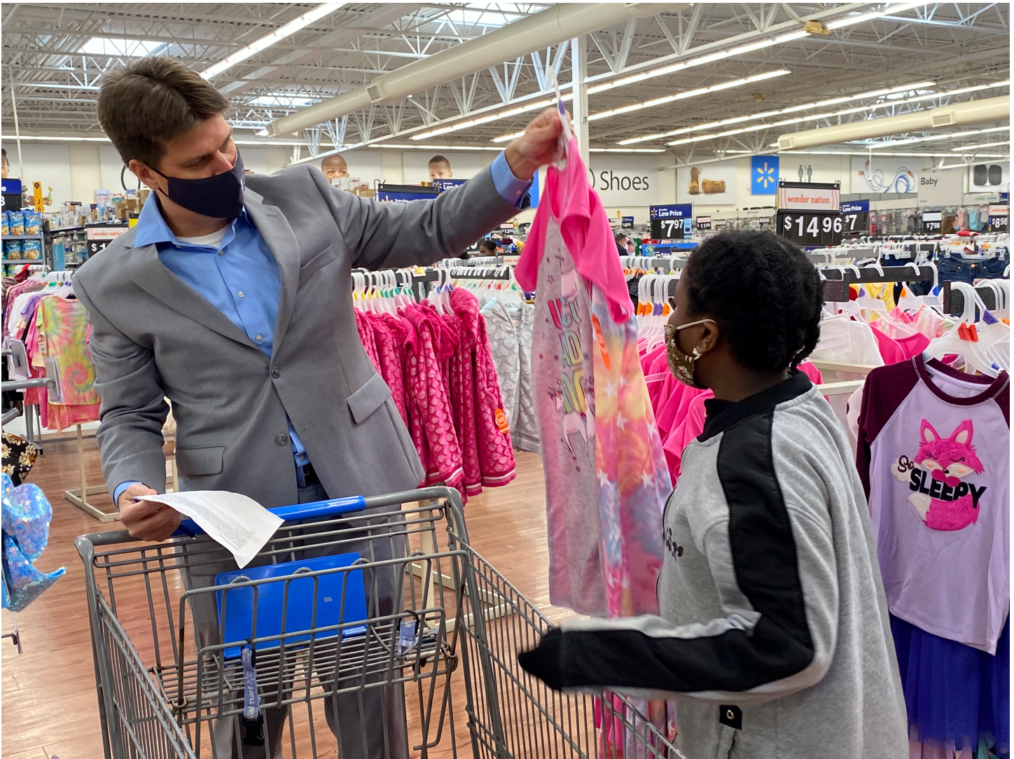
Posted by Samantha Rosado January 10, 2021